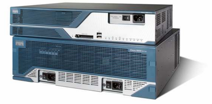
Figure 1. Cisco 3825 and Cisco 3845 Integrated Services Router

Cisco Systems<sup>®</sup>, Inc. redefines branch office routing with a portfolio of Integrated Services Routers optimized for secure, wire-speed delivery of concurrent data, voice, video, and wireless services. Founded on 20 years of innovation, the Cisco<sup>®</sup> 3800 Series Integrated Services Routers provide customers with unparalleled network agility, performance, and intelligence. The Cisco 3800 Series transparently integrates advanced technologies, adaptive services, and secure enterprise communications into a single, resilient system. The Cisco 3800 Series routers ease deployment and management, lower network cost and complexity, and provide unmatched investment protection. The Cisco 3800 Series routers feature embedded security processing, generous performance and high memory capacity, and high-density interfaces that deliver the performance, availability, and reliability required for scaling mission-critical security, IP telephony, business video, network analysis, and Web applications in the most demanding enterprise environments. Built for performance, the Cisco 3800 Series routers deliver multiple concurrent services up to wire-speed T3/E3 rates.