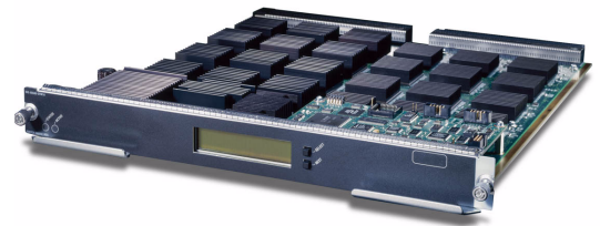
Figure 2 Switch Fabric Module1