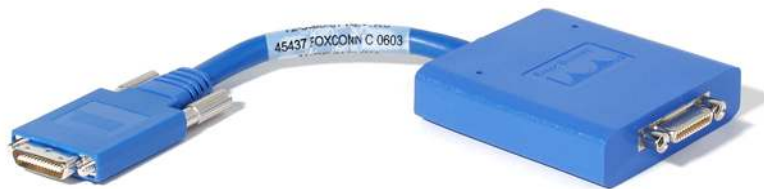
Figure 1. CAB-SS-SURGE Surge Protection Cable

Surge events, including ElectroStatic Discharge (ESD) and lightning surges, are common in many parts of the world, especially during electrical storms. These energy surges can damage electrical equipment and lead to network down time. Cisco surge protection cables for Smart Serial interfaces help protect your network from down-time due to these surge events. If you protect your router from surges via the power input (surge protectors, Uninterruptible Power Supplies, or power conditioners), you should also protect your router serial interfaces.