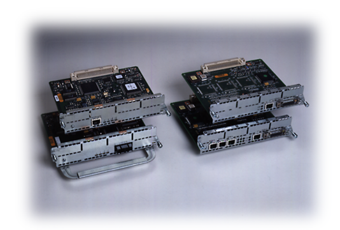
Figure 2 NM-1FE-TX, NM-1FE-FX, NM-4E, NM-1E

Ideal for a wide range of LAN applications, the Fast Ethernet network modules support many internetworking features and standards. Single port network modules offer autosensing 10/100BaseTX or 100BaseFX Ethernet. The TX version supports virtual LAN (VLAN) deployment. In customer networks, these modules may be useful for the following: