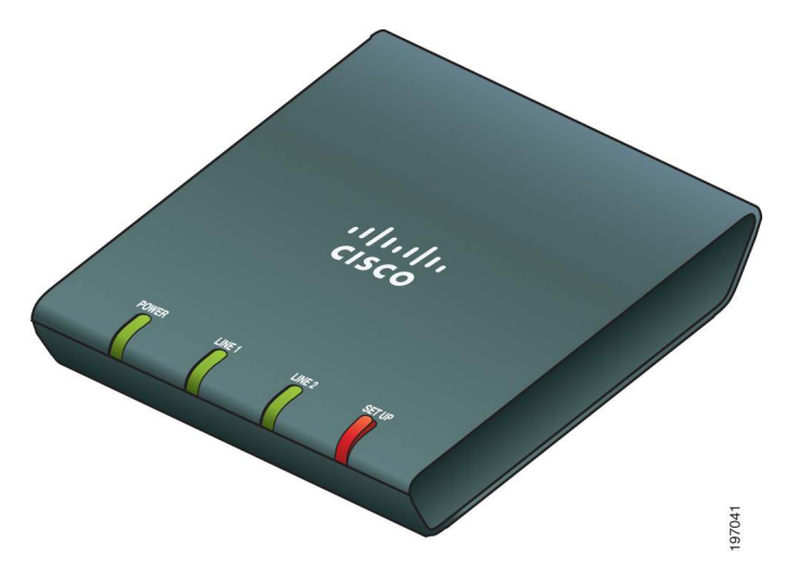
Figure 1. Cisco ATA 187: Endpoint for an End-to-End Broadband System

Enterprise customers are using the Cisco ATA 187 to connect analog phones and fax machines to their VoIP network. Service providers are taking advantage of emerging telephony applications and the ease of deploying second-line services using the Cisco ATA 187 (Figures 1 and 2).