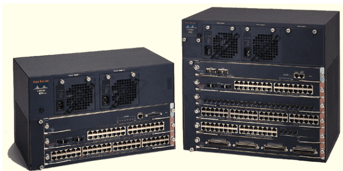
Figure 1 Cisco Catalyst 4003 and 4006

The Cisco Catalyst 4000 48-Port 10/100/1000BASE-T Line Card (RJ-45) (Figure 2) delivers the industry's highest-density, triple-speed, autosensing 10/100/1000 connectivity from the network edge to the desktop. This new line card is affordable for every desktop in the enterprise. Now at the same port density as 10/100, the 10/100/1000 line card provides wiring-closet investment protection by allowing 10 Mbps, 100 Mbps, and 1000 Mbps on the same interface for flexibility and seamless migration to Gigabit Ethernet.