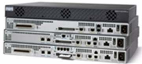
Figure 1. The Cisco IAD2430 Series Devices

The Cisco IAD2430 builds on the Cisco IAD2420's patented Simple Network-enabled Auto Provisioning (SNAP) technology, a next-generation auto-installation mechanism designed for faster service turn-up, configuration, and remote updates. When used with Cisco Configuration Express, service providers can order, preconfigure, and ship the Cisco IAD2430 directly to end customers, reducing the costs of warehousing, shipping, and manual intervention.