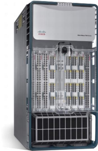
Figure 4. Cisco Nexus 7000 18-Slot Switch Chassis