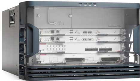
Figure 2. Cisco Nexus 7000 9-Slot Switch Chassis