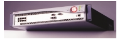
BIG-IP Link Controller 1000

High performance solution including the industry's fastest routing for multi-homed networks, supported by F5's new Packet Velocity ASIC.