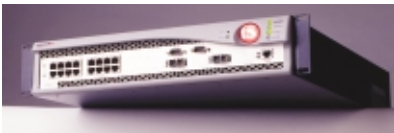
BIG-IP Link Controller 2400

BIG-IP Link Controller functionality is available as a stand-alone switch (BIG-IP Link Controller 1000, or 2400) or as a software module that can be added to any full BIG-IP product. By adding the "Link Control Module" to a BIG-IP platform, customers receive fully functional layer 4-7 application traffic management and multi-homing support.