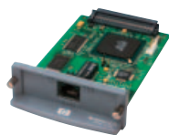
HP Jetdirect 620n

HP Jetdirect Internal Print Servers connect any HP printer with an EIO slot to the network, in a convenient way.