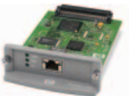
HP Jetdirect 630n