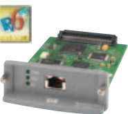
HP Jetdirect 635n