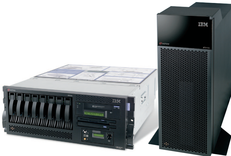
pSeries Model 6C3