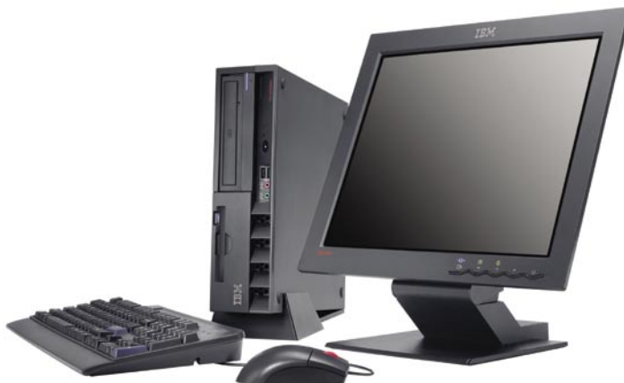
IBM ThinkCentre S50 desktop shown with optional IBM ThinkVision™ monitor

IBM recommends Microsoft® Windows® XP Professional for Business.