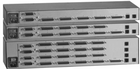
Rear view - UCR 1x4, 1x8, 1x16 (Shown with expansion cards)

■ Phone: 281-933-7673 ■ E-mail: sales@rose.com ■