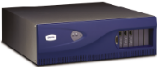
SonicWALL GX Series

In addition to high-performance VPN connectivity and integrated security, the GX250 and GX650 support the comprehensive portfolio of SonicWALL Security Services, including Network Anti-Virus, Content Filtering, and Authentication Service.