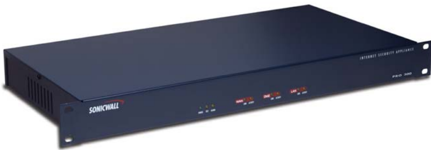
SonicWALL PRO 300

The SonicWALL PRO 300 Internet security appliance meets the demands of growing businesses and adapts to network security threats, protecting an organization's valuable data. With SonicWALL's security ASIC, the PRO 300 delivers maximum multi-user firewall and VPN performance.