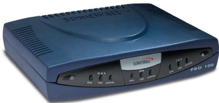
SonicWALL PRO 100