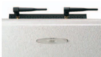
AP 300 (external antennas) mounted above ceiling tile with light pipe.