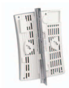
AP 300 (internal antennas) shown mounted to T-Bar used in suspended ceilings.

The AP 300 is designed to provide maximum flexibility for fast and easy installation, offering wall, ceiling and above ceiling tile mounting options. The internal antenna version snaps onto the T-bars of suspended ceilings without the use of any hardware, reducing installation time. The external antenna version can be installed above ceiling tiles, and all hardware to install a light-pipe through the ceiling tile is provided. Either version can also be wall mounted.