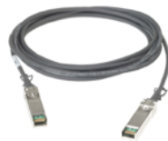
10GBASE-CR Copper Cable

Integrated optics on some products deliver cost effective solutions that are optimized for a choice of interface speed and density in an all-in-one MXP (multi-speed port) interface. The MXP interfaces present standard fiber interfaces and are fully compliant to the relevant IEEE specifications ensuring multi-vendor interoperability as well as the benefits of extended reach and increased reliability.