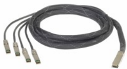
10GBASE-CR: QSFP+ to 4 x SFP+