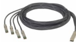
40GBASE-CR4 to 4x 10GBASE-CR Copper Cable