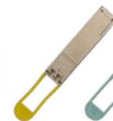
40GBASE-LRL4, UNIV, LR4 and XSR4 QSFP+