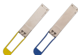
100GBASE-LRL4 and LR4 QSFP