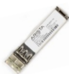
10GBASE-SR and LR SFP+