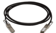
100GBASE-CR4 Copper Cable