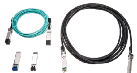
25GBASE-CR, AOC, SR and LR