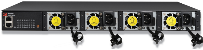
Figure 3: Brocade ICX-EPS 4000 for the Brocade ICX 7250, shown with four AC power supplies.