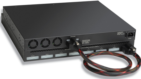
Figure 4: Rear view of the Brocade ICX-EPS 4000 connectivity.