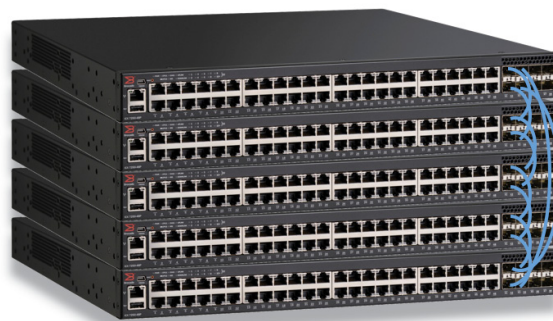
Figure 1: Up to 12 Brocade ICX 7250 Switches can be stacked together using up to four full-duplex SFP+ 10 Gbps ports for a fully redundant backplane with 480 Gbps of aggregated stacking bandwidth.

entire campus network. These powerful deployments deliver equivalent or better functionality than large, rigid modular chassis systems, but with significantly lower costs and smaller carbon footprints.