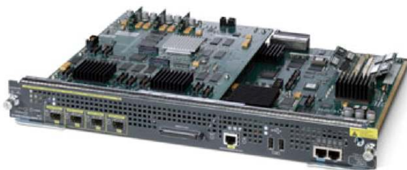
Figure 1. Cisco 7304 NSE-150 Network Services Engine

The NSE-150 is the forwarding engine or route processor for the Cisco 7304; it uses Parallel Express Forwarding (PXF) technology to deliver hardware-accelerated network services with up to 3.5-Mpps forwarding rate; it also has an 800-MHz microprocessor CPU to support a rich feature set in Cisco IOS® Software with high performance and scalability. With four onboard Gigabit Ethernet ports, the NSE-150 also increases the overall port density of the platform and maximizes the value of customers' investments (Figure 1).